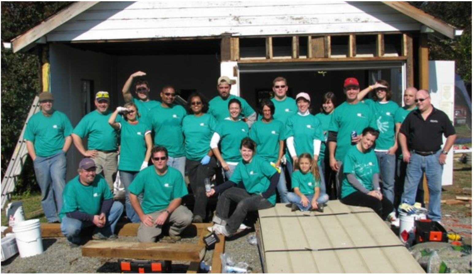
Above: South Sound Chapter of the Mortgage Brokers Association